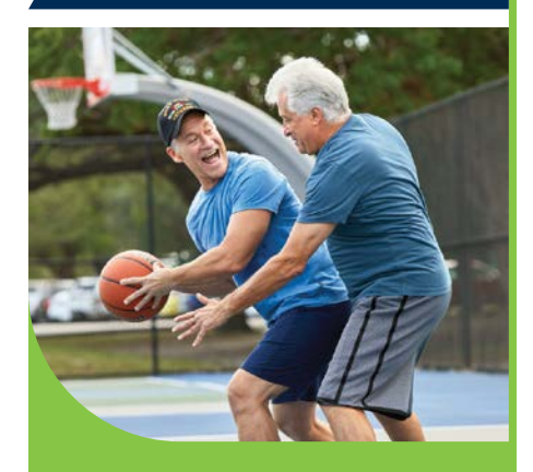
Call a licensed Humana sales agent