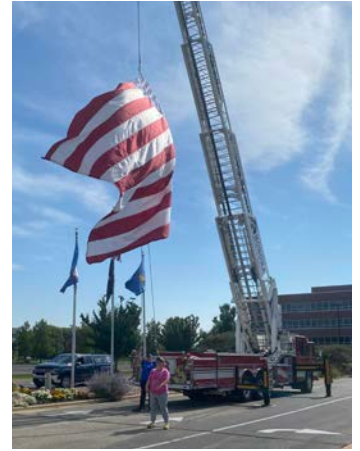
Last ones are through; taking down the flag.