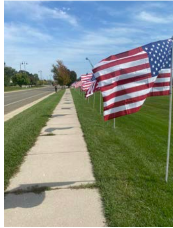
Flags on Broadway during Ruck 22 in September. Home stretch — about 2 miles left of 12 miles.

Do you help individuals or community organizations? Report your hours, mileage, and activities for VFW community service statistics. Post members, contact the Post Quartermaster (221-9326); Auxiliary members, tell Carol Welch (608-882-1398; ryanaxa@charter.net).