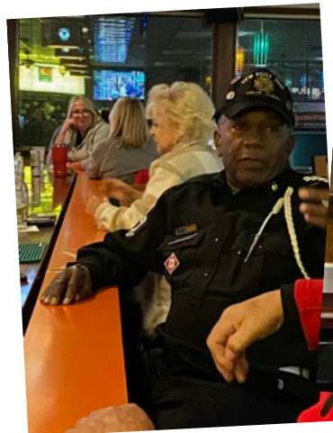
JJ back at the Post.