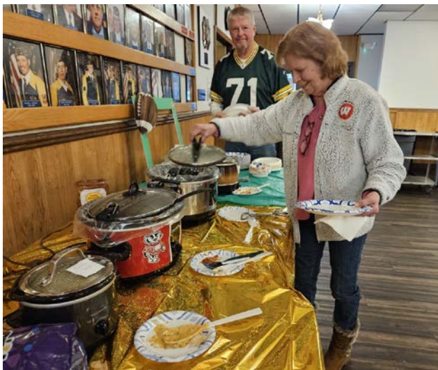
January 4, Post Canteen – Patrons enjoy the expansive potluck provided by members during the Packer / Viking game.