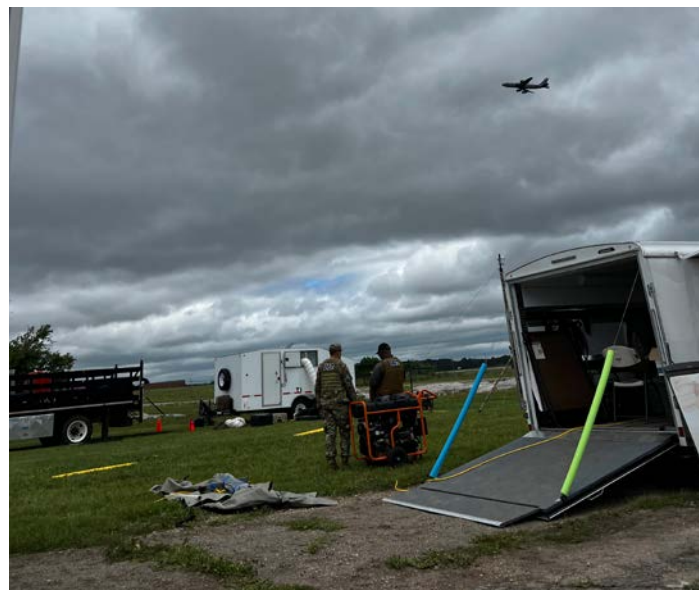
above and upper right: Post commander Lukas Cross supporting the CERFP (CBRNE Enhanced Response Force Package) during our EXEVAL training event with the 641st Troop Command Battalion; a demanding week filled with rain, mud, and long hours of field operations and systems support.

Enjoy your Independence Day weekend—stay safe, make memories, and if you can, send us a photo of your celebrations! Let's keep sharing the moments that make our post family strong.